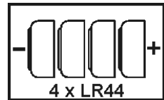
Fig. 5.1. Correct battery placement

Be careful with polarity (+/-) of batteries. Batteries should be placed into device according to fig. 5.1.